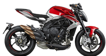
AGO RED/ AGO SILVER