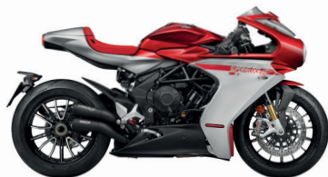
SUPERVELOCE S WITH DEDICATED KIT*