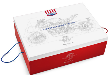
DRAGSTER RR SCS AMERICA DEDICATED KIT