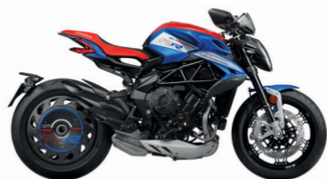
AGO RED (GLOSS)/ MICA AMERICA BLUE (GLOSS)/ INTENSE BLACK (GLOSS)