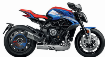
WITH SPECIAL PARTS KIT*