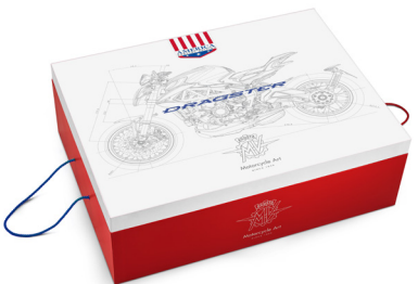
DRAGSTER RR SCS AMERICA DEDICATED KIT