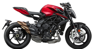
METALLIC MADNESS RED/ METALLIC CARBON BLACK