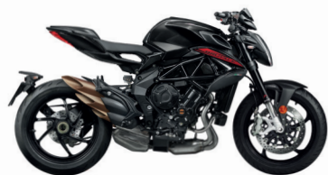
METALLIC CARBON BLACK (GLOSS)