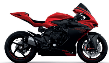
FIRE RED MATT/ METALLIC DARK GRAY MATT (with Racing Kit)**