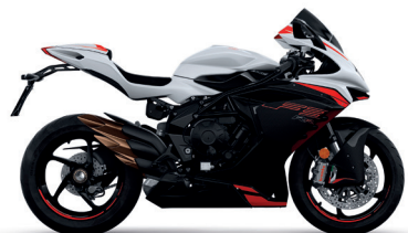
SURREAL WHITE GLOSS/ MAMBA RED GLOSS (Standard version)