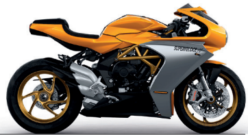
PEARL METALLIC YELLOW/ MATT METALLIC GRAPHITE