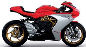
AGO RED/AGO SILVER