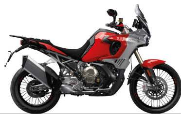
AGO RED (GLOSS)/ AGO SILVER (GLOSS)

The full Special Parts range is available on the MV Agusta website