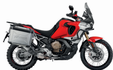
OPTIONAL SPECIAL PARTS VERSION**