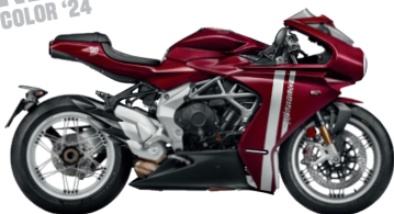
ROSSO VERGHERA/ ARGENTO AGO