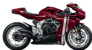
WITH RACING KIT**