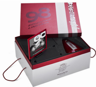
CERTIFICATE + DEDICATED KIT